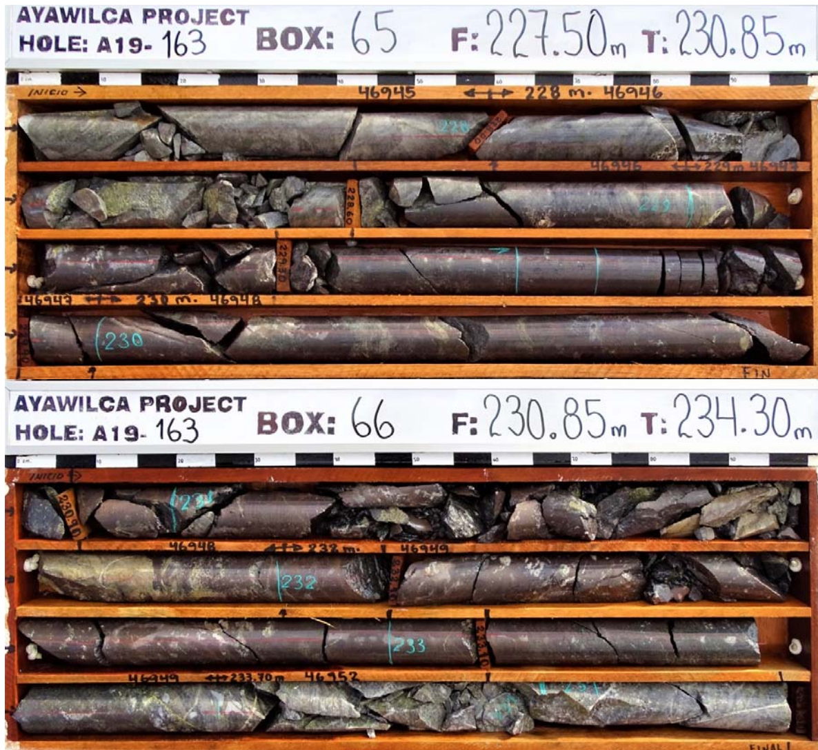
Figure 2. Drill core of high grade interval (228-233.7 m) grading 32.6% zinc, 0.02% lead, 20 g/t silver. Sphalerite is noted by the reddish colour

Note: True thicknesses of the zinc intersections in Table 1 are estimated to be at least 85% of the downhole thicknesses as the zinc mineralization at Ayawilca is generally flat-dipping replacement of layers or ‘mantos’ hosted by limestone and/or sandstone. The true thickness of the silver intersection cannot be determined at this time as insufficient data is available.