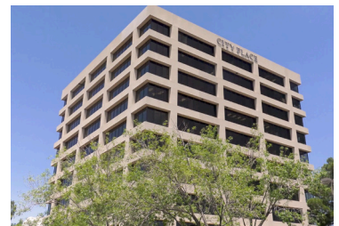
In Albuquerque, most Aerospace employees work at two main locations, Aerospace offices at City Place (as shown above) and Kirtland Air Force Base.

Aerospace engineers in Albuquerque provide comprehensive capabilities for research and development and rapid response access to space, including mission planning, acquisition and development, satellite and launch vehicle integration, ground systems, and flight operations. This includes support for the Space and Missile Systems Center's Innovation and Prototyping Directorate, Space Rapid Capabilities Office, the Launch Enterprise's Small Launch and Targets Division, Air Force Research Laboratory's Space Vehicles Directorate, and DOD's Space Test Program, which includes NASA manned flight missions for Johnson Space Center.