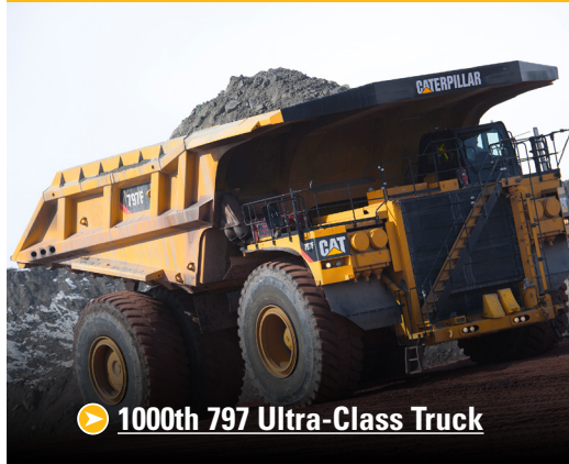
➤ 1000th 797 Ultra-Class Truck