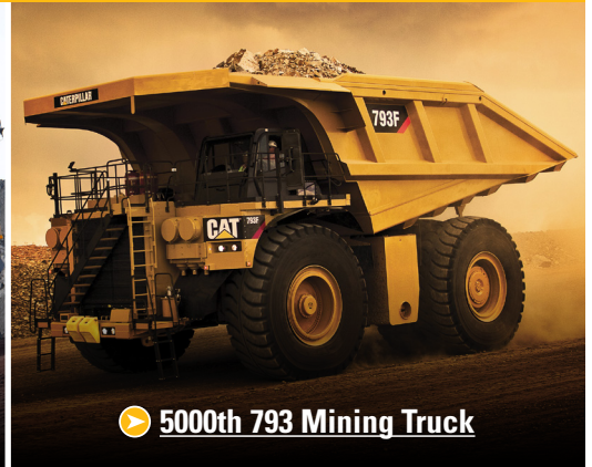
➤ 5000th 793 Mining Truck