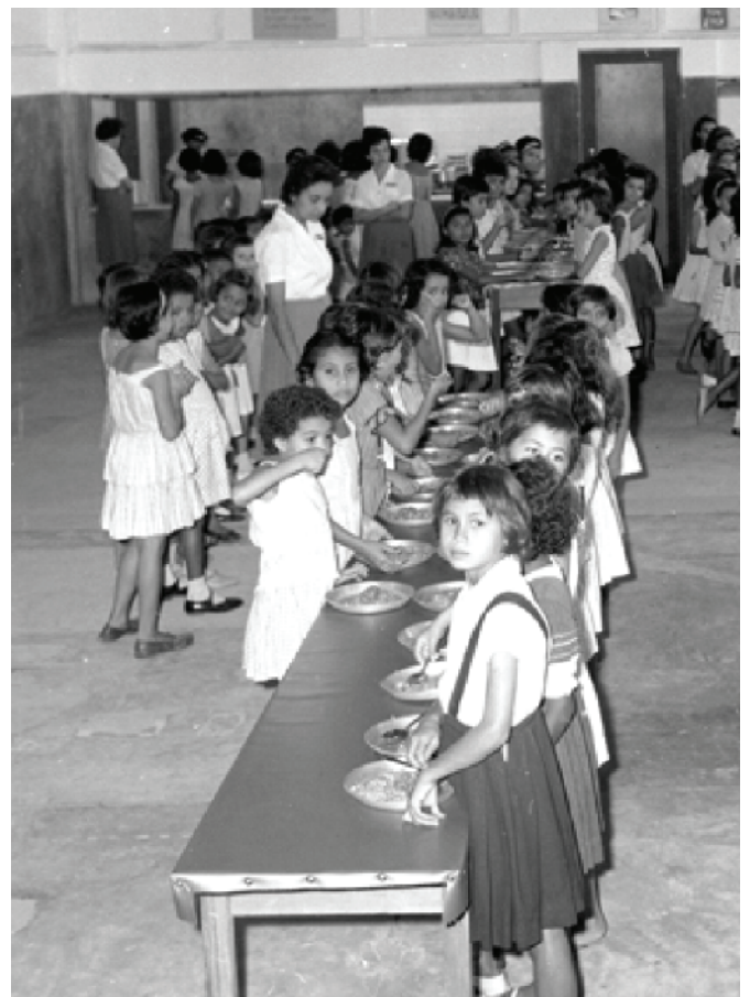
Escola Johnson cafeteria 1963