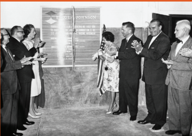
Escola Johnson dedication 1963