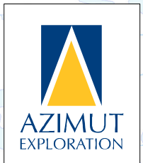
Figure 1 - Press release dated July 06, 2017