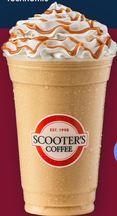
Our Signature Caramelicious®