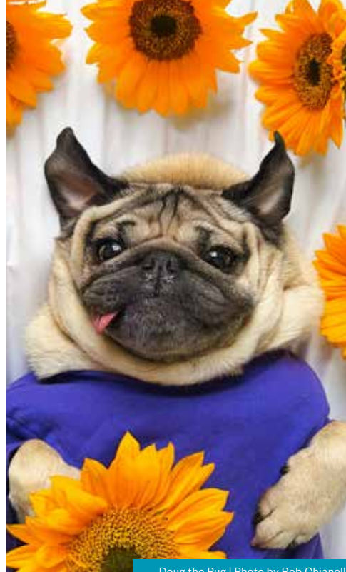
Doug the Pug