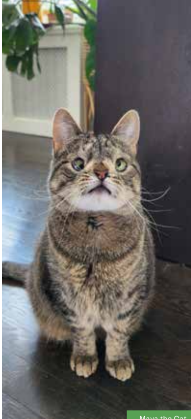
Maya the Cat