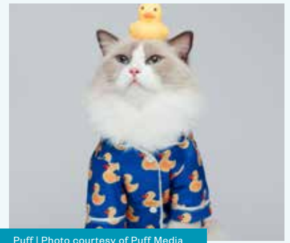
Puff