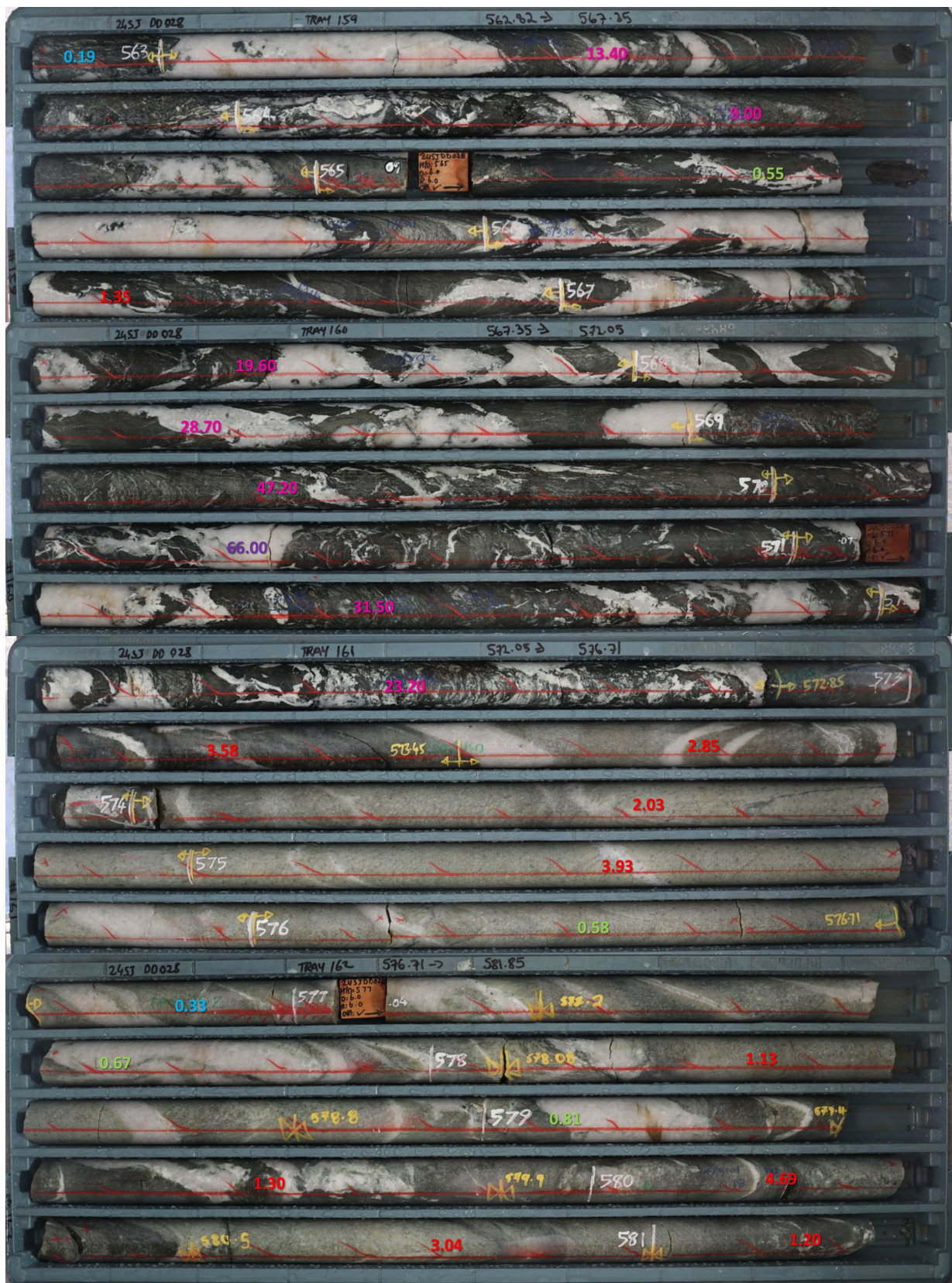
Figure 3 – South Junction Drill Hole 24SJDD028 showing the individual gold assay results (g/t) for the “Polar Star Lode” which returned 13.71m @ 18.02g/t Au from 563.00m (Refer to Appendix A for details).