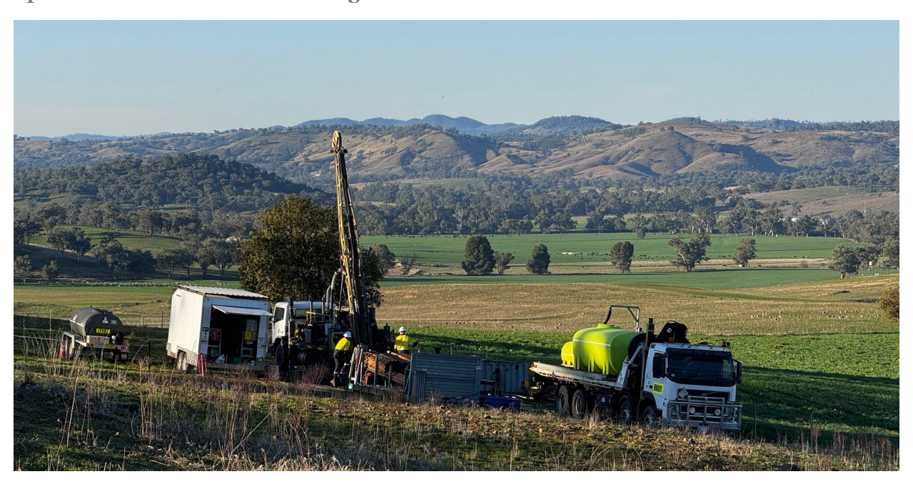
Figure 3: Earth AI's low cost Mobile Low Disturbance ("MLD") diamond rig in operations at Cundumbul drilling hole ECU18D