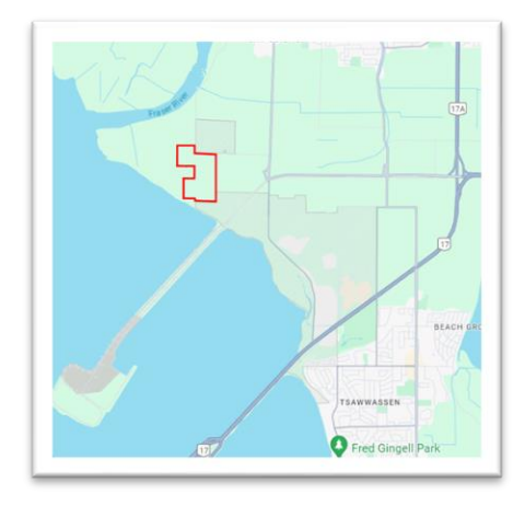
The Delta region. The red outline depicts the Brunswick Point lands to be incorporated into Tsawwassen lands.