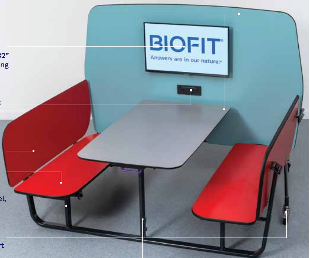
Model shown: FBT-H-EL-VD Monitor not included.

Pneumatic lift-assist and intuitive catch and release handle help promote safe deployment and folding