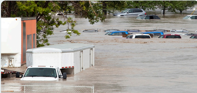
CALGARY FLOOD – June 20, 2013