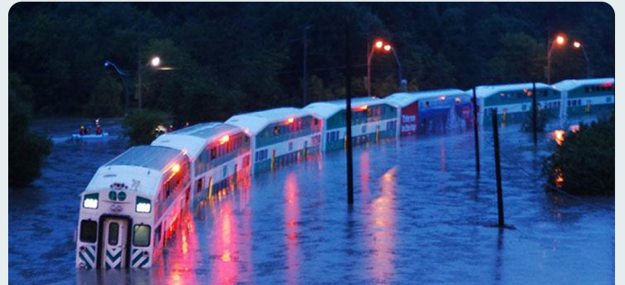
TORONTO FLOOD – July 8, 2013