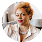
ORION BROWN BLACKTRAVELBOX® @blacktravelbox