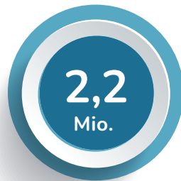
Swiss chronic patients (Potentially)