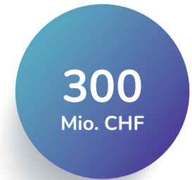
Impact on savings in health care costs per year