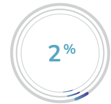
Have life-threatening interactions