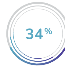
Have adverse interactions