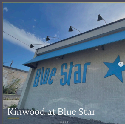
Kinwood at Blue Star