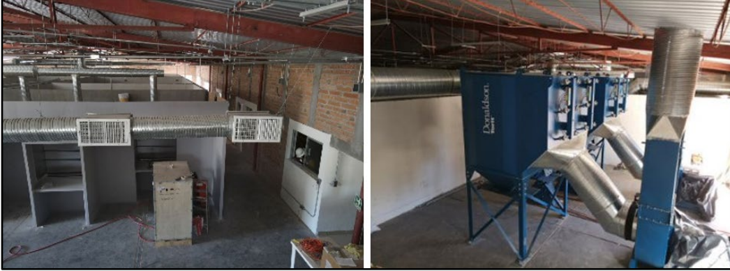
Figure 8: Assay Lab