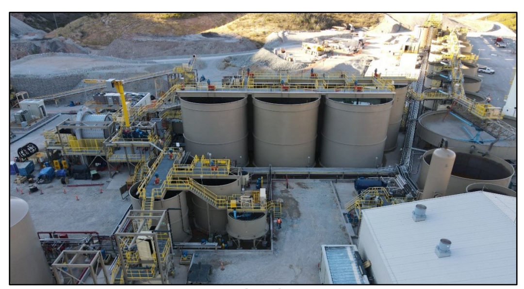
Figure 4: Leach Tank Construction