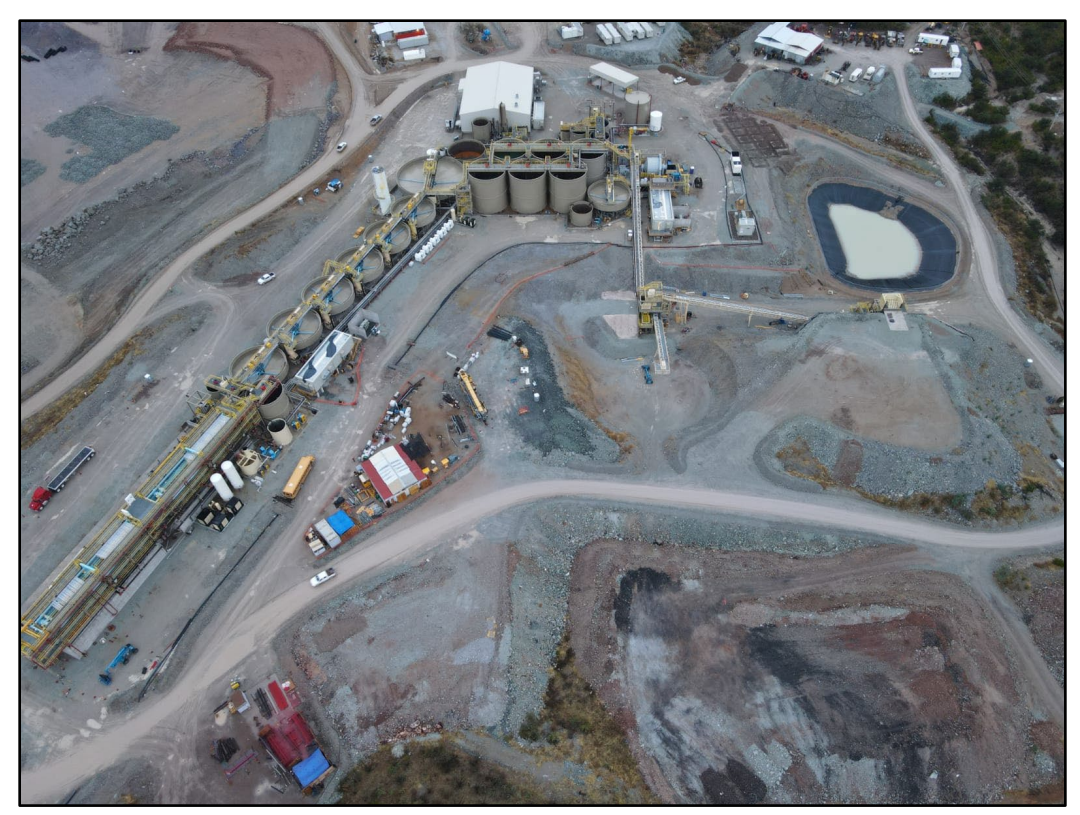
Figure 1: Drone Image of Process Plant Construction and Stockpiles