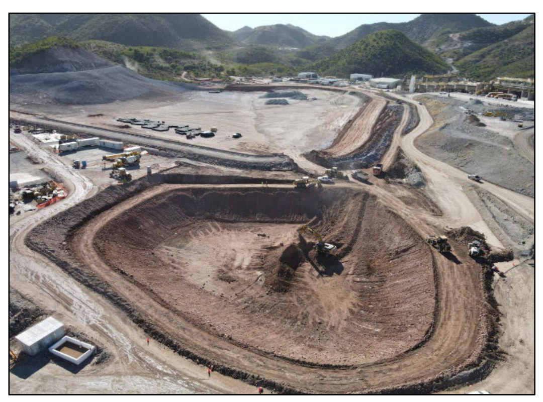
Figure 11: Filtered Tailing Facility