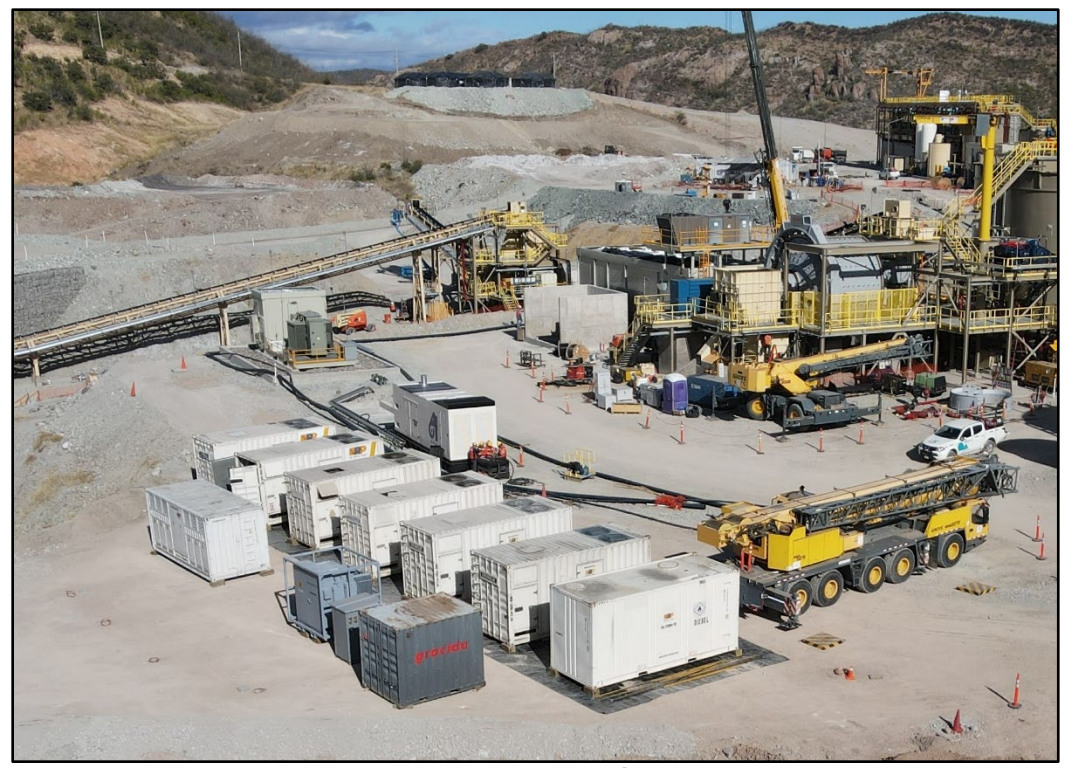
Figure 5: Temporary Diesel Generators