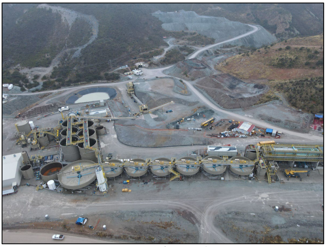
Figure 2: Overview of Process Plant Area