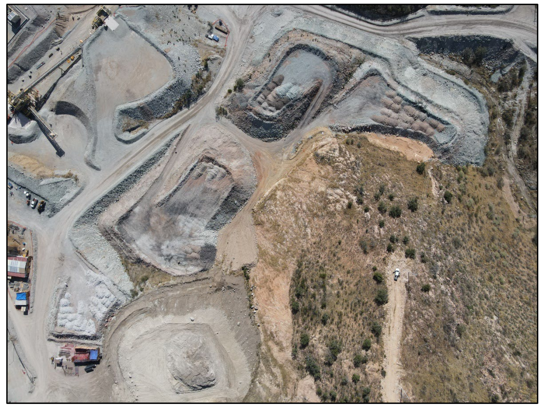
Figure 9: Stockpiles