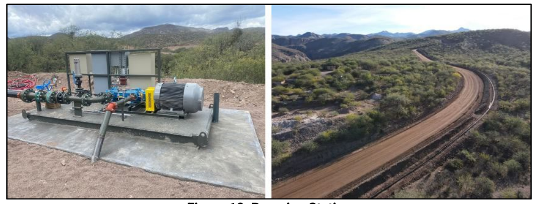
Figure 10: Pumping Station