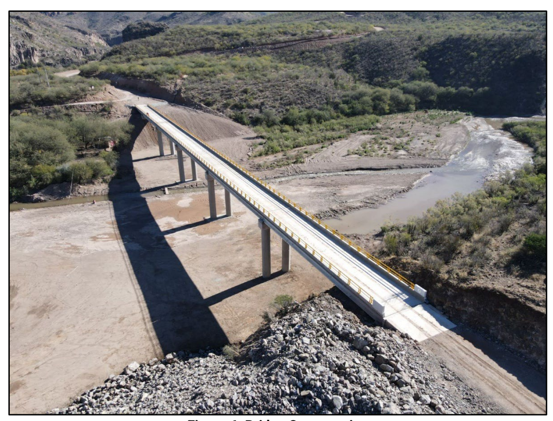
Figure 6: Bridge Construction