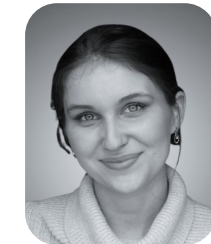
Laura Infographie / DA