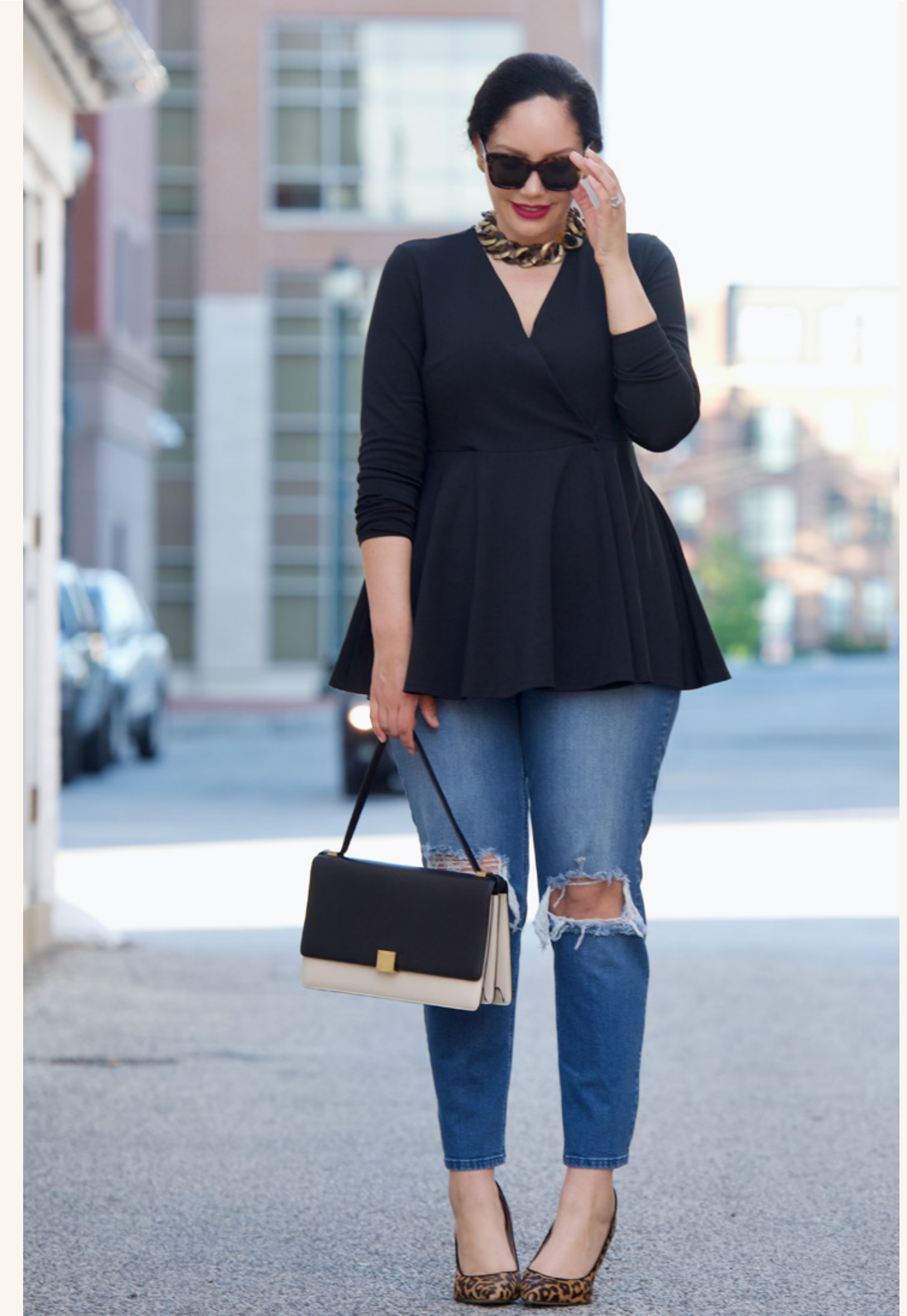
PONTE PEPLUM BLAZER A452277 | BLACK, IVORY, NAVY