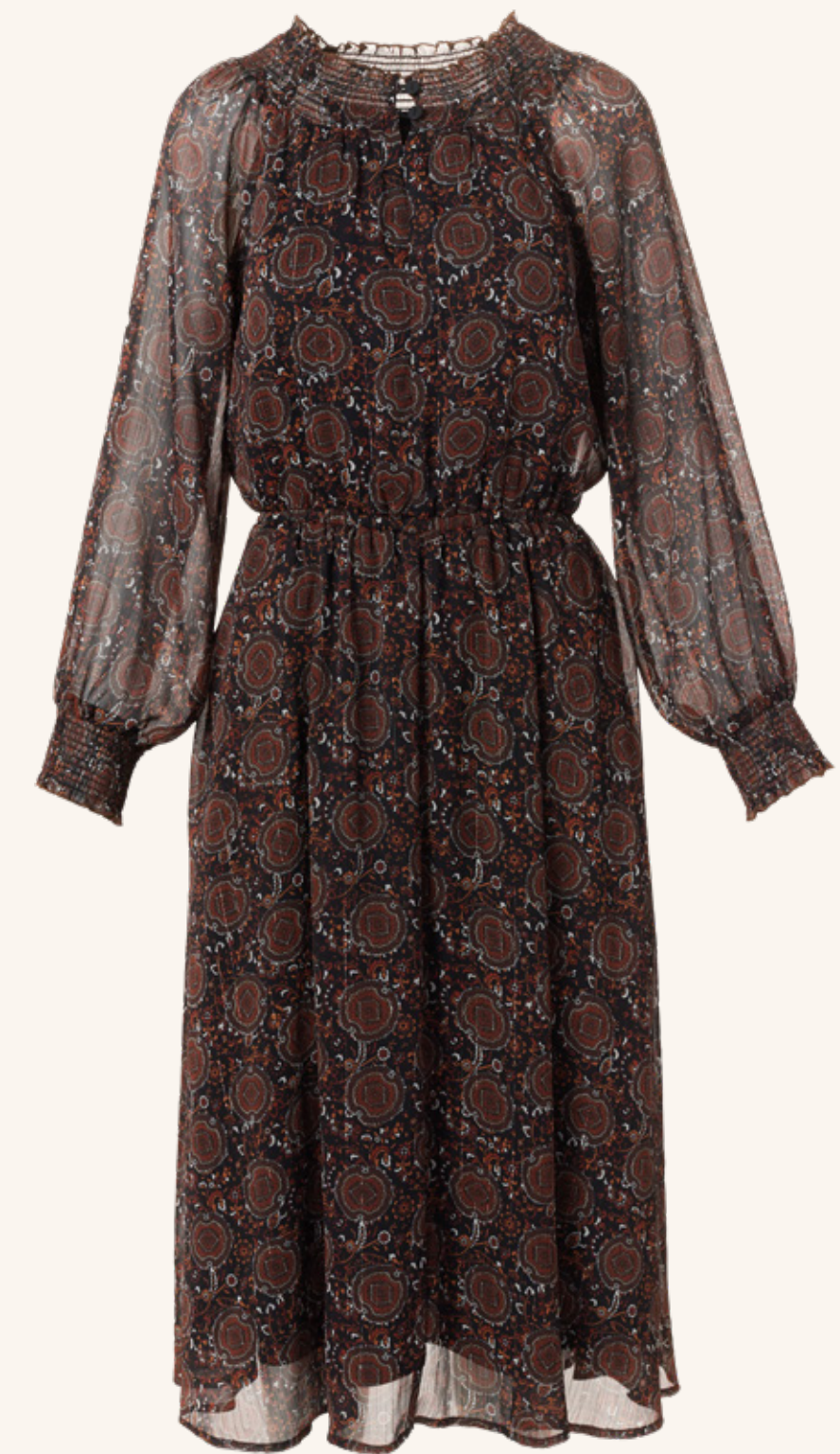
BLOUSON SLEEVE MIDI DRESS