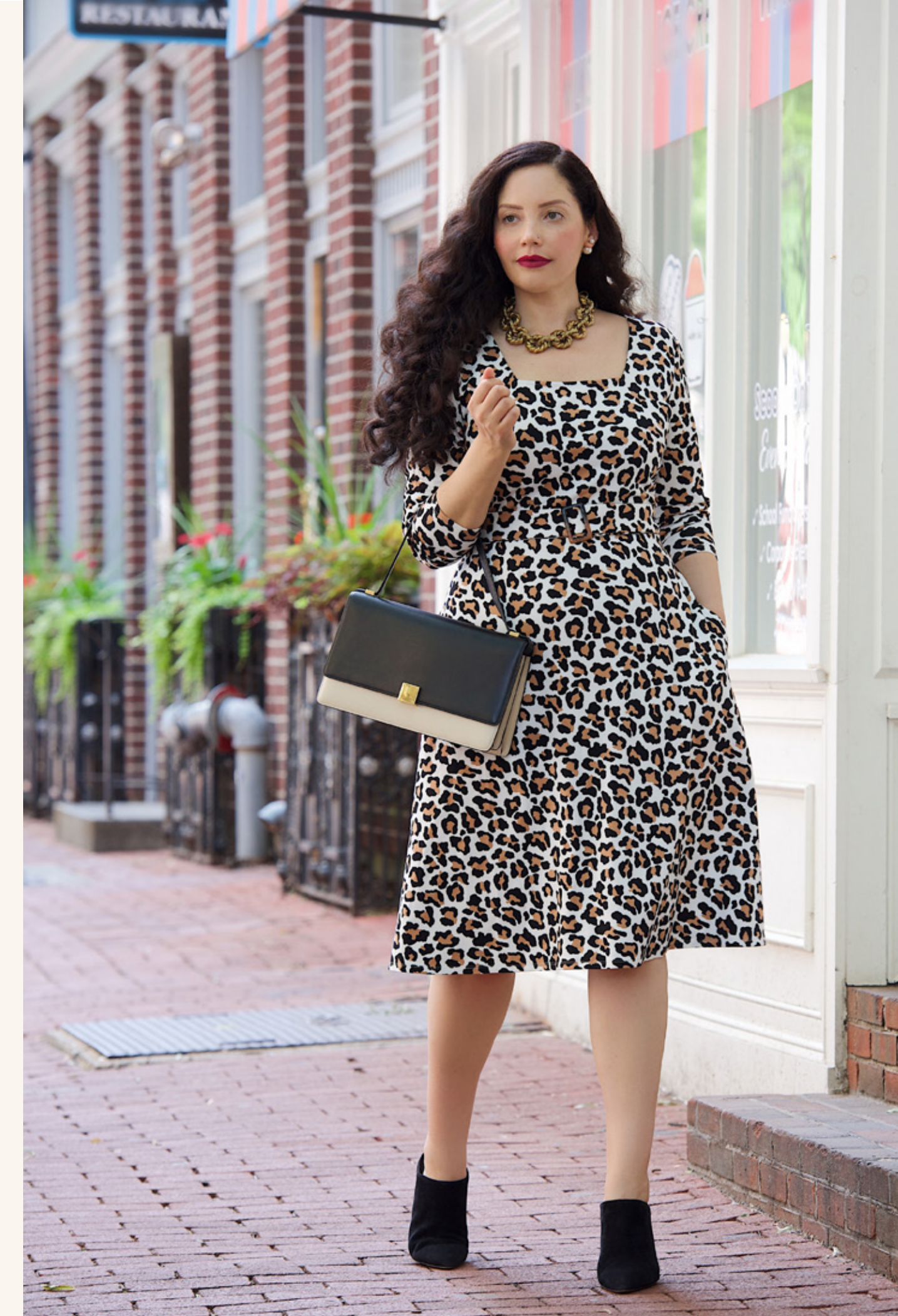
PONTE MIDI DRESS WITH SELF BELT