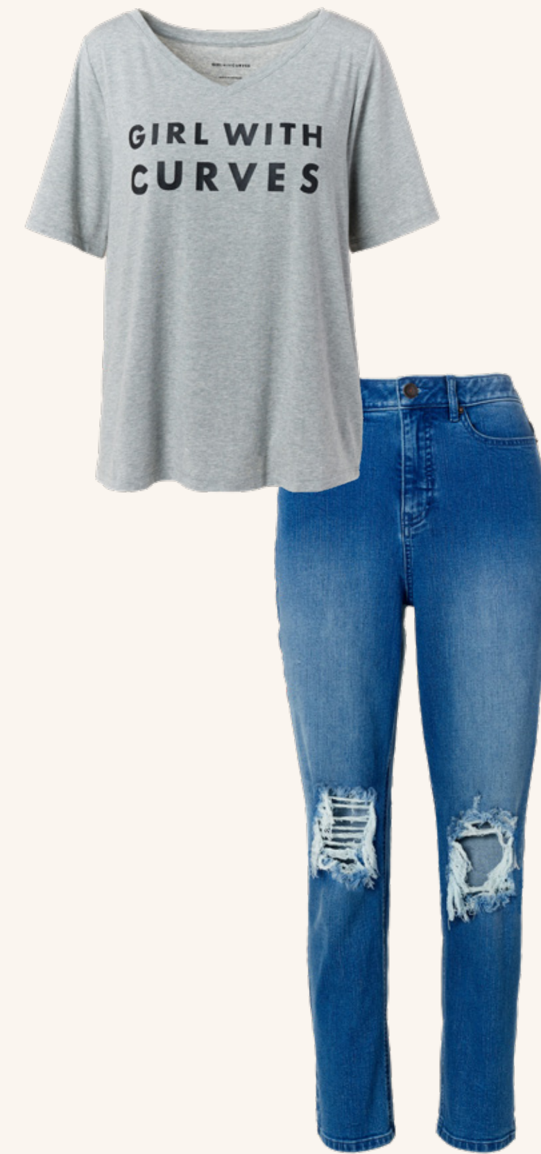
GWC SCREENPRINT V-NECK TEE