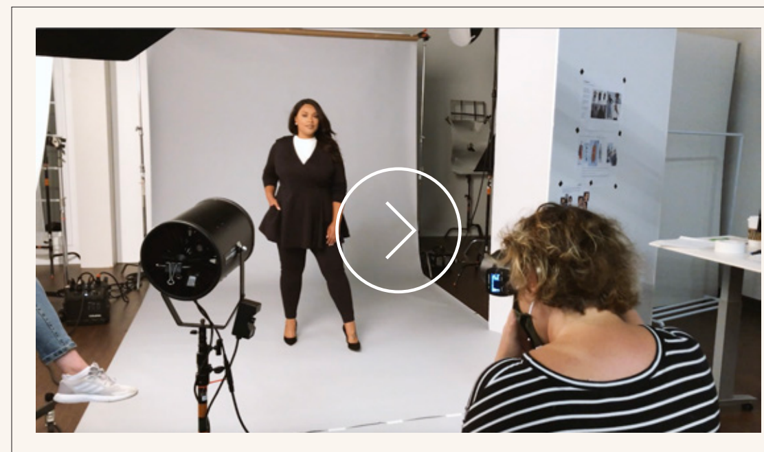
GWC DESIGN PHILOSOPHY [1:33]