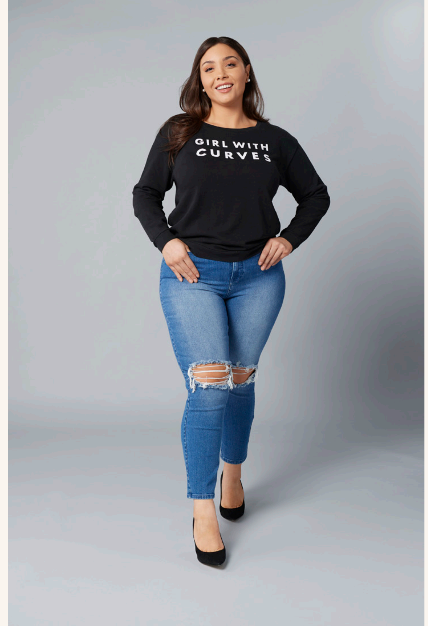
GWC FRENCH TERRY SWEATSHIRT