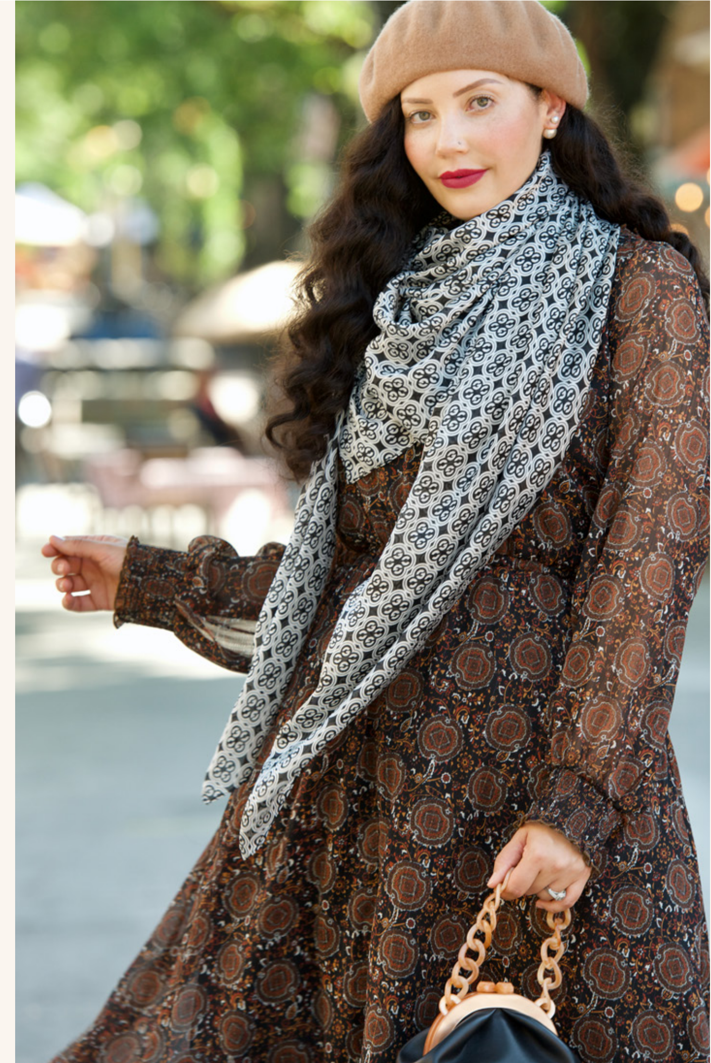
GWC LOGO PRINT SCARF