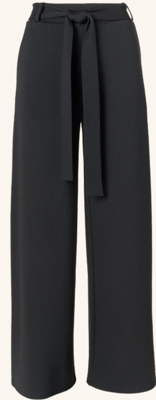
WIDE LEG PONTE PANT