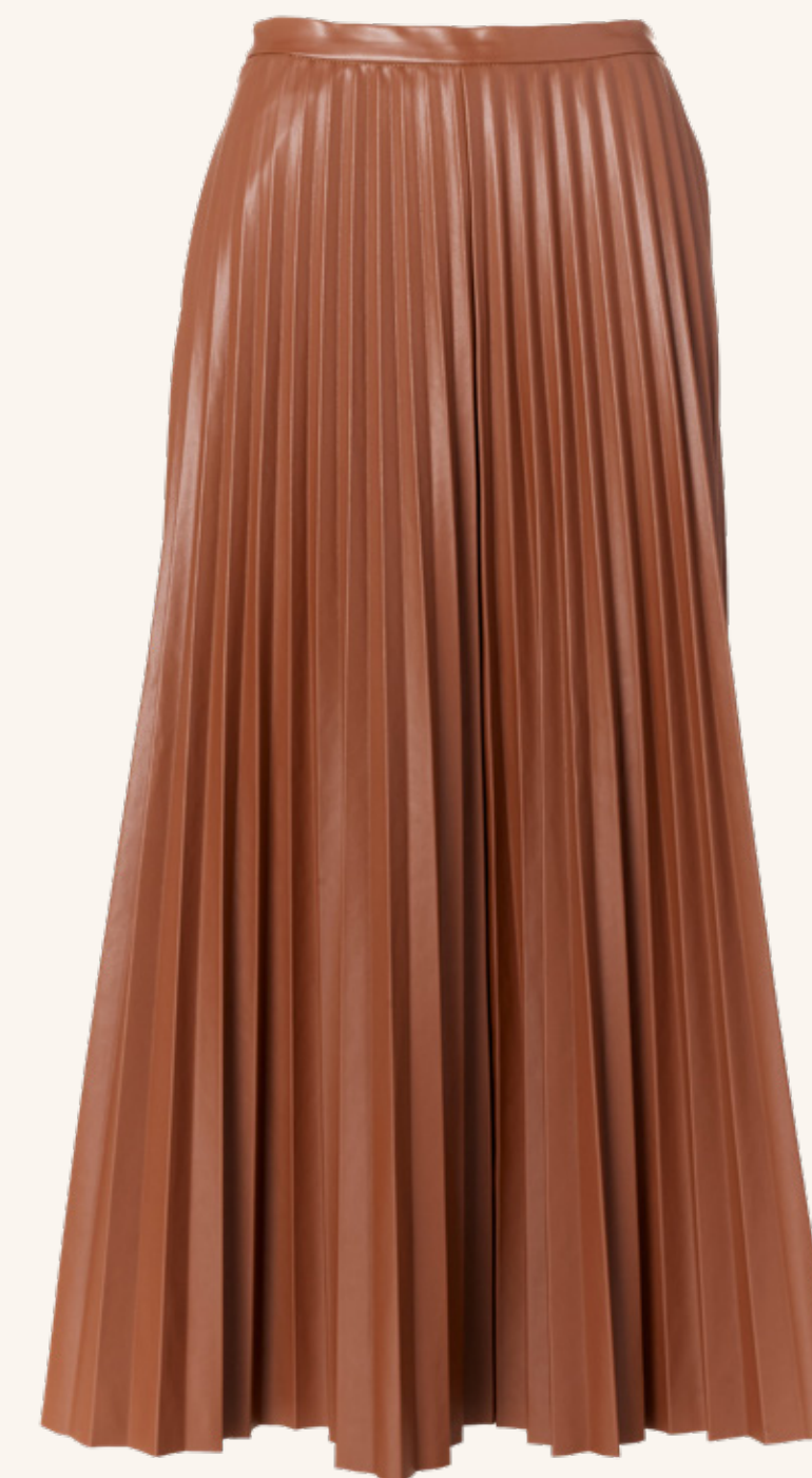
FAUX VEGAN LEATHER PLEATED ANKLE SKIRT