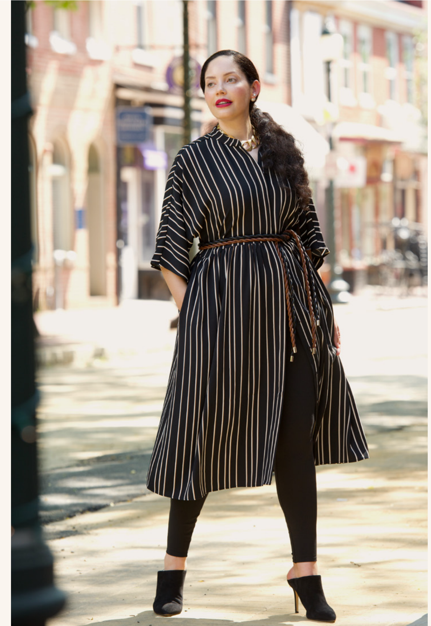
DOLMAN MINI DRESS WITH SELF BELT