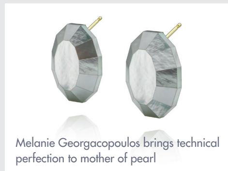
Melanie Georgacopoulos brings technical perfection to mother of pearl

The inclusion of less orthodox materials in jewelry of the highest quality encourages us to reframe 'preciousness' – typically defined by price and scarcity – in order to acknowledge the value of thoughtful design and appreciate the meaning inherent in the materials themselves.