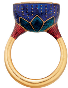
Alice Cicolini ring, handcrafted in Jaipur, where craftsmen apply richly colored enamels - known in Europe as champlevé