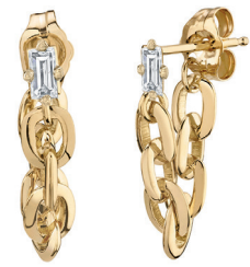
Lizzie Mandler: classic earrings with a modern touch