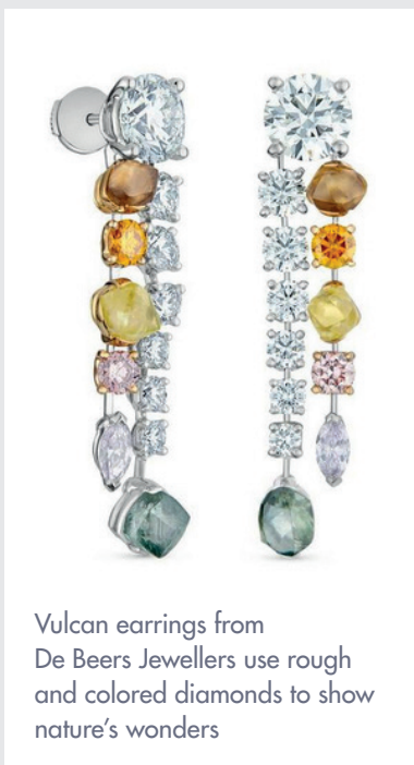
Vulcan earrings from De Beers Jewellers use rough and colored diamonds to show nature's wonders