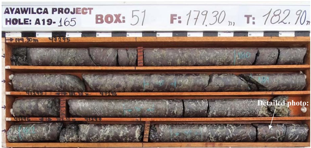
Figure 2. Drill core photographs from the interval in A19-165 grading 18.9% zinc, 42 g/t silver, 0.5% lead, & 584 g/t indium over 7 metres from 178.4 metres. Various phases of zinc sulphides are noted by red-purple-brown hues.

Details of assay intervals within the core photo above: