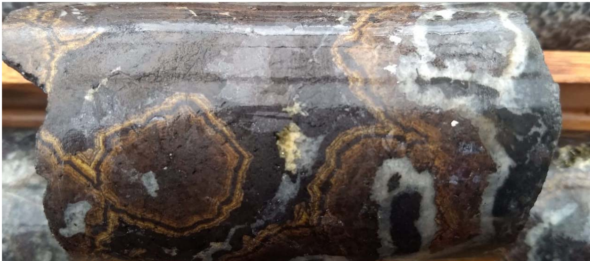
Figure 3. Detailed photo of zinc sulphide textures (see arrow above): iron rich sphalerite or marmatite (purple) with bands of later low iron sphalerite (brown and yellow) and quartz (white). The banding of the zinc sulphides highlights multiple stages of zinc mineralization at Ayawilca.

Note: The photos shown in Figures 2 and 3 are of selected intervals and not necessarily indicative of mineralization hosted on the property.